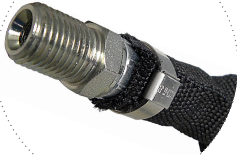
Hose Sleaving Secured with a BAND-IT JS Clamp

Among common sleeve clamping methods, the BAND-IT JS clamps had the highest retained force and most consistent installation when installed with the IT Series Pneumatic Tools. As a comparison, the strength of the 3/8" JS clamp was compared to other common hose sleeve clamping methods using an Axial pull test: